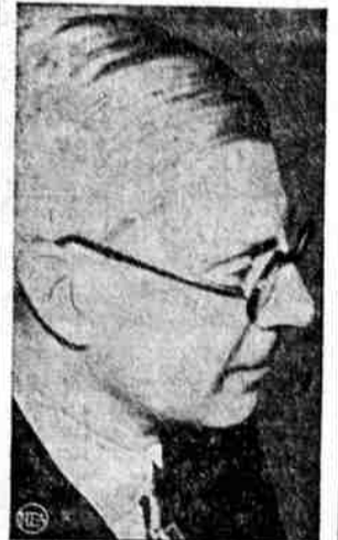
Oliver Stanley, above, replaced Leslie Hore-Belisha as Great Britain's war secretary in a major cabinet shakeup. He now is responsible for the entire army operation. Formerly he was trade secretary.