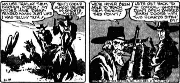
BY HAROLD GRAY