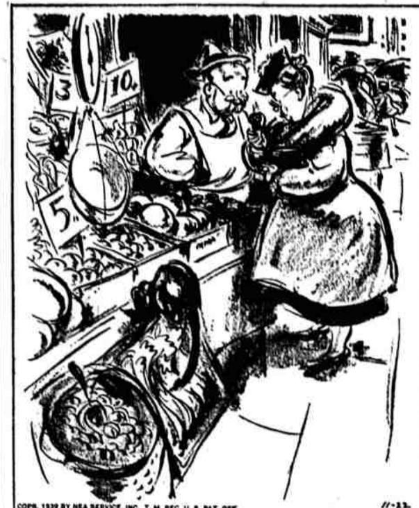
"I'll sell 'em to you, but my experience is they give you indigestion."