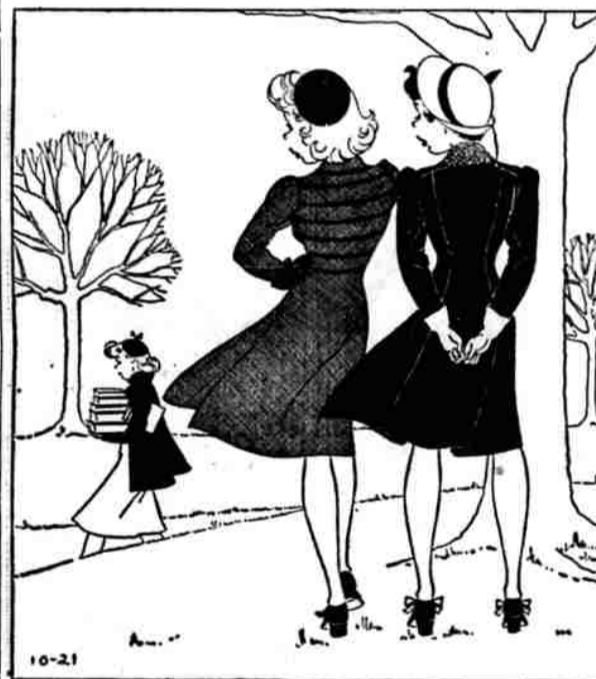
"Why can't she get dates?" "Ever notice, the less books a girl carries the more boys she has to carry 'em?"

COPY, 1939 BY NEA SERVICE, INC. U. S. REG. U. S. PAT. OFF.