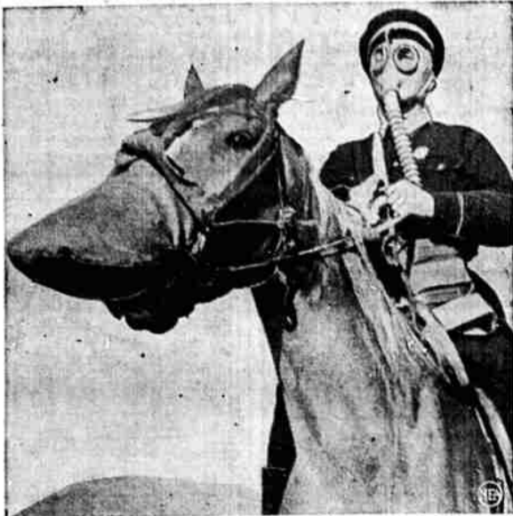
War-time variation on the old feed-bag: The gas-masked horse of a gas-masked Russian cavalryman.