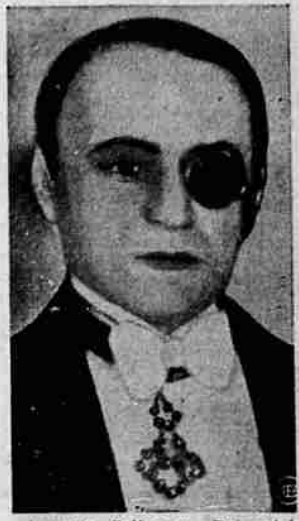
Armand Calinescu, Rumania's "strong man" with pro-ally sympathies, assassinated in Bucharest Thursday allegedly by the pro-Nazi "Iron Guard" faction. Eight Iron Guardists were executed on the spot where Calinescu was machine-gunned in his automobile.