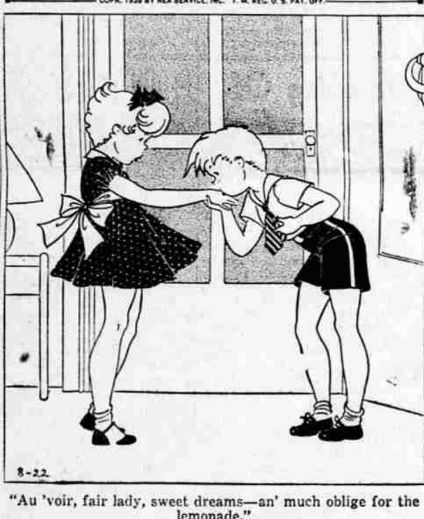
"Au' voir, fair lady, sweet dreams—an' much oblige for the lemonade."