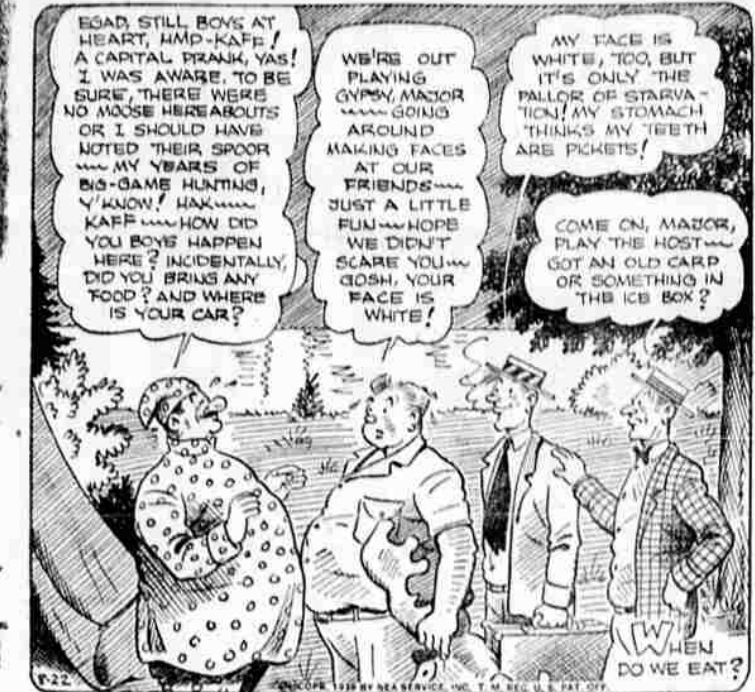
WHEN DO WE EAT?