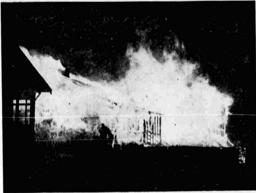
Here is another house, going up in a sheet of flames.