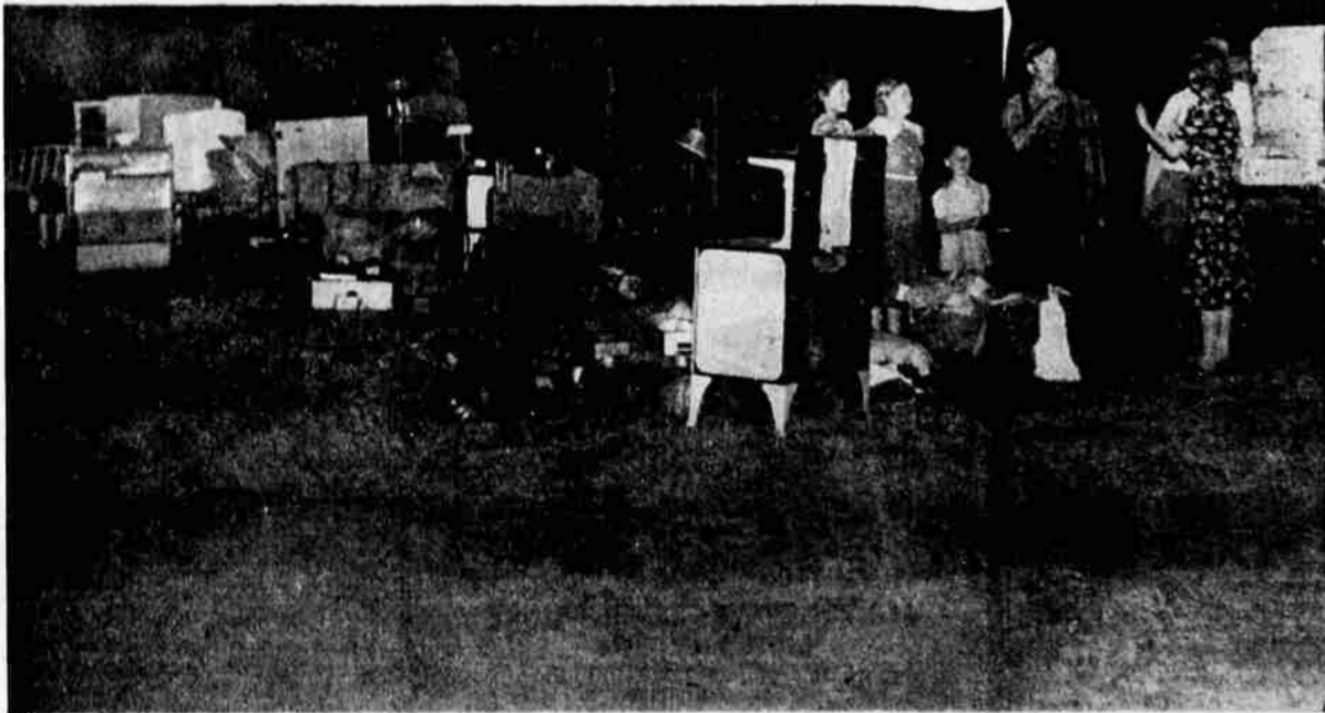
Here among their belongings, Pine Ridge residents talk over the conflagration that deprived them of homes and jobs.