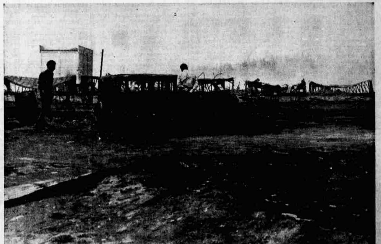
This automobile underwent a terrific scorching. Glass from the windows melted down and lay in the bottom of the car when spectators looked it over Sunday.