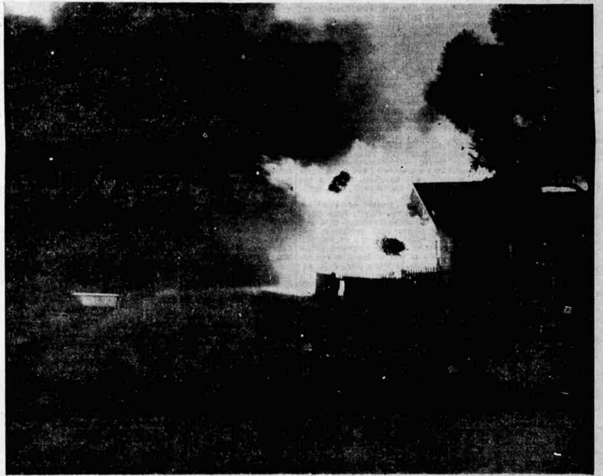
This night shot shows a house which has just exploded into flame. Note, across the road, a bathtub yanked from the residence ahead of the flames.