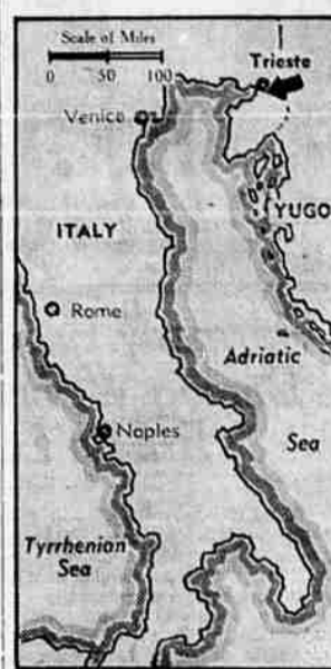
Map shows location of Trieste, Italian industrial seaport, on which Mussolini is reported to have given Hitler 10-year lease. If report is true, Nazi Germany gains port on Adriatic, becomes Mediterranean power.