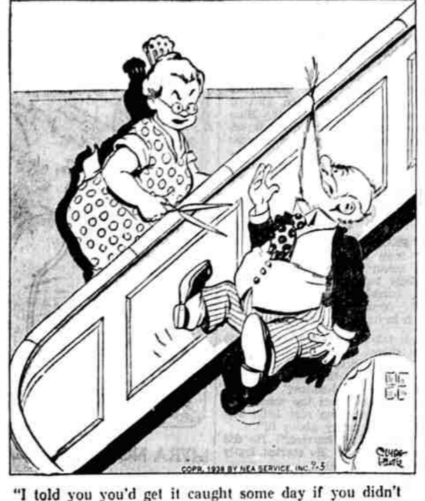
"I told you you'd get it caught some day if you didn't stop sliding down the banister."