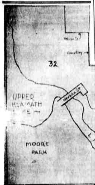
MAP SHOWS VOTING PRECINCTS IN CITY