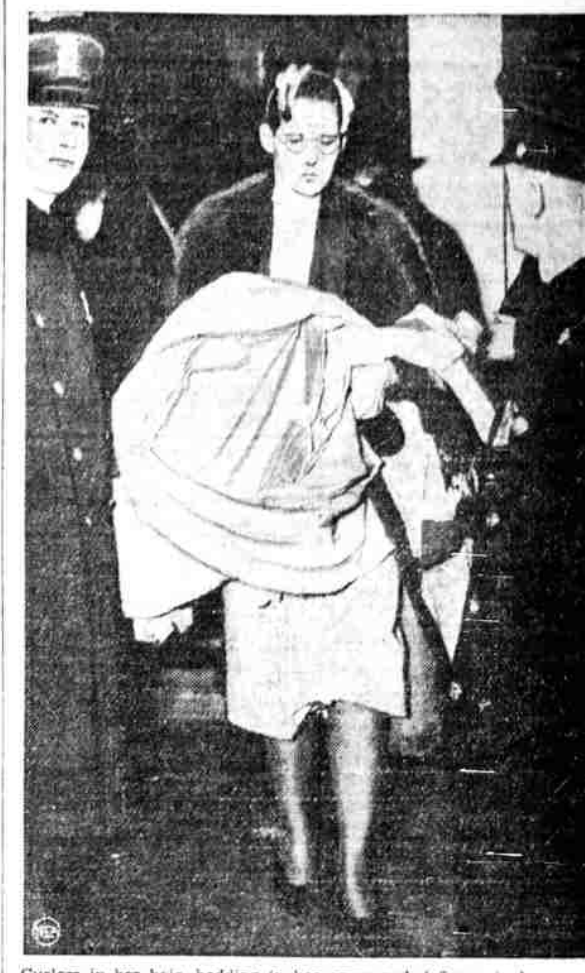
Curlers in her hair, bedding in her arms and defiance pression, this young woman marched off to jail with 85 other fem-nine sittlown strikers when police evicted them from a Detroit cigar factory. The eviction from the cigar plant and another fac-tory incensed labor leaders, brought a general strike threat to Detroit.