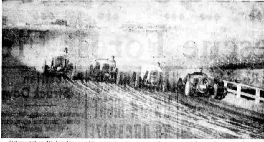
Picture taken Wednesday evening as auto racers warmed up at the fairgrounds for the inaugural Sunday of the Klamath Racing association's program. The cars in the picture are the A and H special, the Eddie Nelson special, the Bohemian special, and the Pelican special. (Herald-News Photo-Engraving).