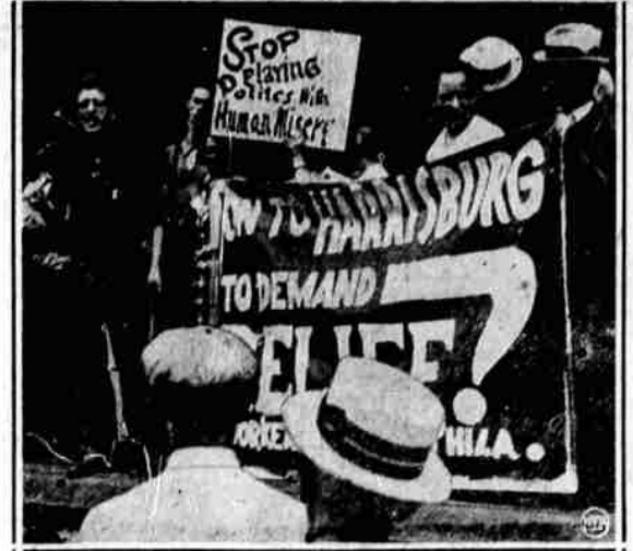
With a threat to "capture the capitol" unless the legislature terminated the relief deadlock and provided funds for their sustenance, unemployed men and women of Pennsylvania marched on Harrisburg in a formidable outburst of resentment. Leaders of the "hunger march" are pictured addressing a demonstration to recruit followers in Philadelphia.