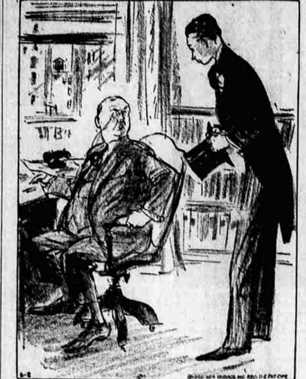
"All right, go ahead and get married, but try to be back in half an hour."