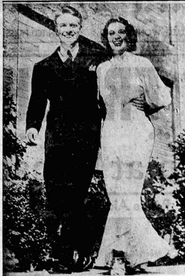
It must be love, for when Nelson Eddy, singer, returned to Hollywood after a concert tour he was greeted by Eleanor Powell, tap dancing star of the screen, with kisses and affection. Friends say there's romance in the air for the couple, shown above.