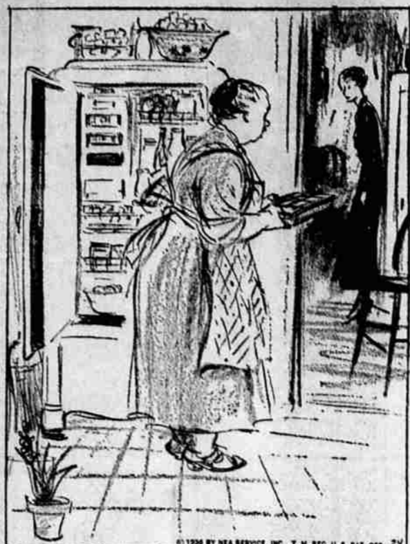
"I like this new refrigerator fine, ma'am, but it's freezing ice cubes faster than we can use them."