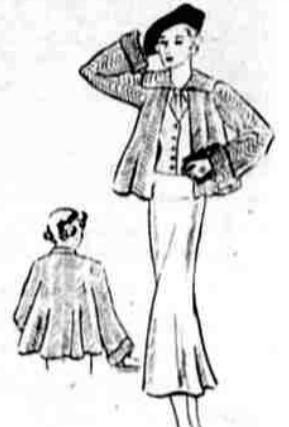
Very smart for street wear this spring is this closely fitting dress with contrasting jacket. The treatment of the front of the dress, its vest effect, is new and decidedly smart. Fullness in the back of the jacket adds distinction.

Naturally, it is sometimes impossible to have corresponding accessories for every dress in the wardrobe. When this is the case, the hat, purse, gloves, hose and shoes should be selected with the idea that they will harmonize with the various costumes at hand. For example: never choose