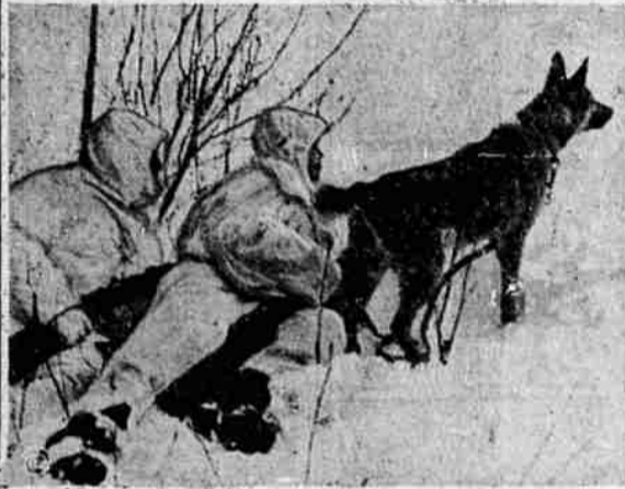
Not Ku Kluxers on the prowl, nor little White Riding Hoods and the bad wolf, but burly Soviet border guards and their service dog are pictured above, as sharp human and canine eyes carefully scan the horizon for signs of the enemy. In frigid border zones of Soviet Russia, army scouts prefer these hooded white gowns, which render them virtually invisible in the snow.