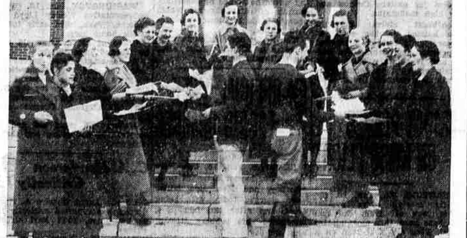
Oregon State college co-eds deliver filled-out petitions signed by students asking Oregon voters to pass the bill authorizing student activity fees at state higher educational institutions. More than two-thirds of the 3,135 students signed the petition during a brief campaign conducted by student leaders.