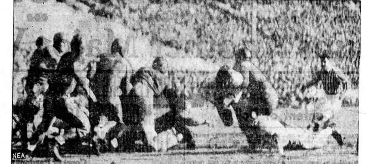
The red horde of Stanford struck swiftly against the Texas Mustangs from Southern Methodist University in the celebrated annual game in Pasadena Rose Bowl, before 85,000 spectators.