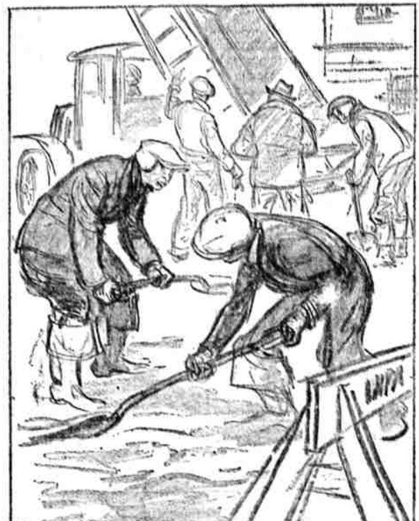
"I don't like to turn in such a big day's work, but you gotta move around to keep warm anyhow."

news ticker one of Ham Fish's apparently endless series of statements. The congressman called a local news office and tried to induce the editor to use the headline: "Fish Breaks Long Silence."