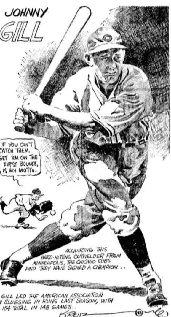
GILL LED THE AMERICAN ASSOCIATION IN SLUGGING IN RUNS LAST SEASON, WITH A 154 TOTAL IN 148 GAMES.