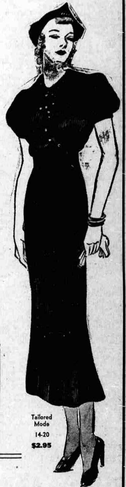
Tailored Mode 14-20 $2.95