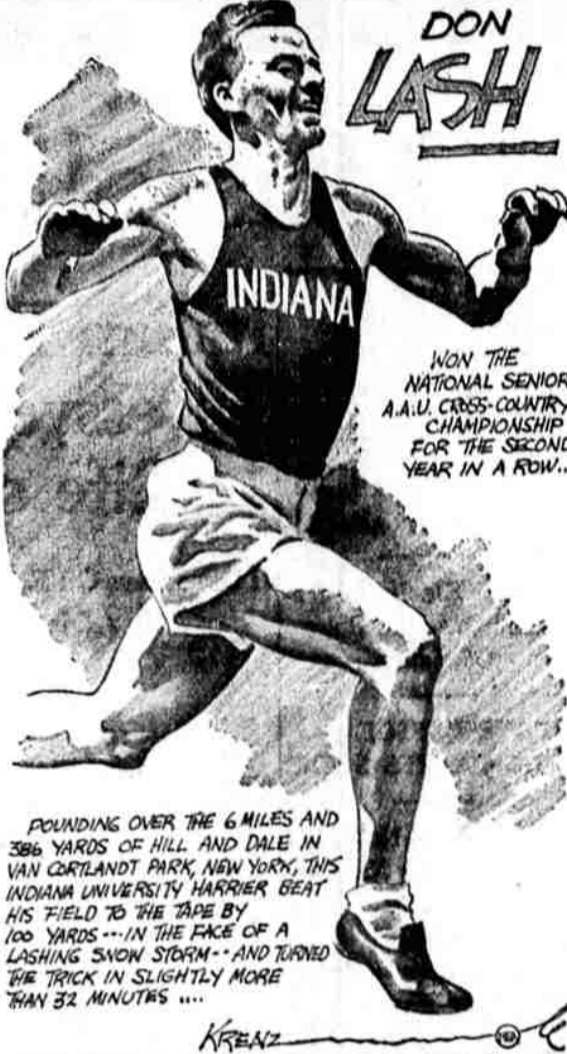
POUNDING OVER THE 6 MILES AND 386 YARDS OF HILL AND DALE IN VAN CORTLANDT PARK, NEW YORK, THIS INDIANA UNIVERSITY HARRIER BEAT HIS FIELD TO THE TAPE BY 100 YARDS... IN THE FACE OF A LASHING SNOW STORM... AND TURNED THE TRICK IN SLIGHTLY MORE THAN 32 MINUTES....