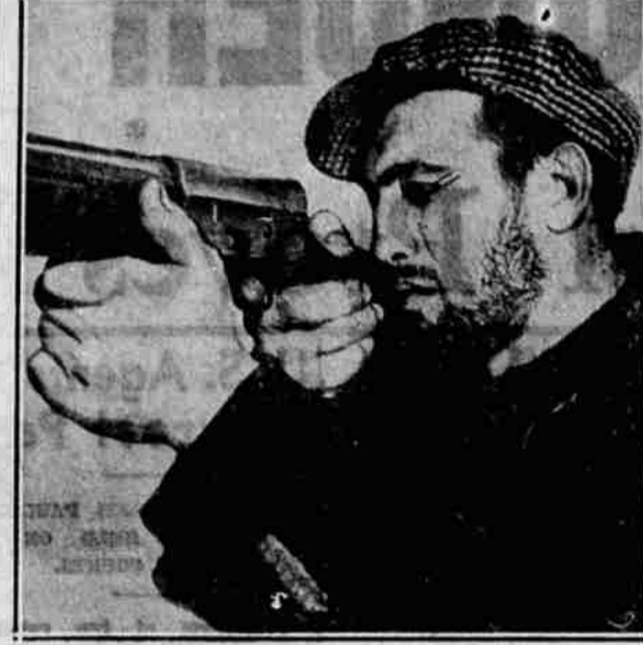
Hiding behind four weeks' hirsute growth, Primo Carnera trundled into New York from Moosehead Lake, Me., and forthwith answered Max Baer's uncompromising remarks about his ability with, 'Ho! ho! I fear this gigolo good.' Here's the champion trying to peer through his whiskers at the sights of a big-game gun.