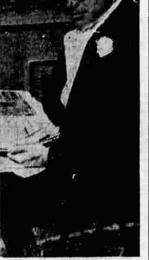
Will Rogers in the title role of "David Harum," his latest Fox picture, seems to be wondering what it's all about.

Vox—Now playing, "Queen Christina," with Greta Garbo and John Gilbert.