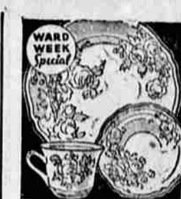
Dinner Set Service for 61 Gay floral de-sign on ivory background.

Maybe never again a chance like this! Wards reliable quality. The great big tub-size that does a whole week's wash for 4 people in 1/2 hour. Ward Week price so low it's hard to believe it!