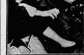
AUTOMATIC CLUTCH —start, stop, shift, reverse—and never touch the clutch pedal. You never need to use your left foot... and the Dodge has Free Wheeling too! Only Dodge in its field offers this combination.