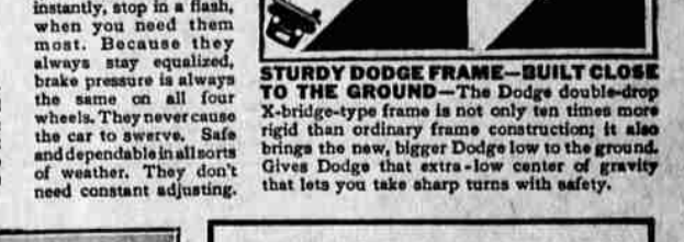
STURDY DODGE FRAME—BUILT CLOSE TO THE GROUND —The Dodge double-drop X-bridge-type frame is not only ten times more rigid than ordinary frame construction; it also brings the new, bigger Dodge low to the ground. Gives Dodge that extra-low center of gravity that lets you take sharp turns with safety.

NEW EASY WAY TO COMPARE CARS! Ask any Dodge dealer for a copy of the new 1934 Dodge "Show-Down" score card. It lets you compare all the brand new 1934 cars feature against feature. The "Show-Down" Plan is easy to use. Full complicated mechanical terms in every day language. Lets you be the judge... in your own way... right at home.