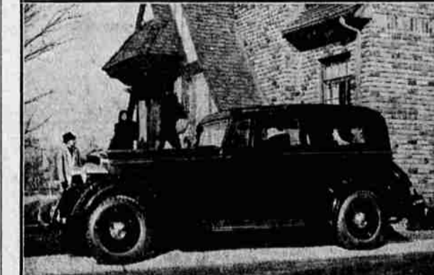
YOU HAVE TO COMPARE this Dodge 5-passenger, two-door Sedan with others to appreciate its amazing value. Costs only a few dollars more than many lowest-priced cars which haven't hydraulic brakes, Floating Power, and all-steel body. Only $695 F. O. B. Factory, Detroit.