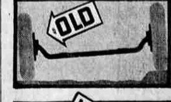
DODGE "FLOATING-CUSHION" WHEELS —When either front wheel of the Dodge strikes a bump, the wheel—independent of the rest of the car—rises and falls with the bump. No tilting of the car. With "Floating-Cushion" Wheels, patented Floating Power engine mountings, hydraulic shock absorbers, shock proof cross-steering, Airwheel tires and long 117-inch wheelbase, Dodge is the only car in its field to offer a smooth, vibrationless, completely leveled ride!