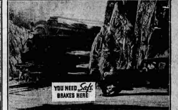
YOU NEED Safe BRAKES HERE