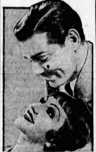
Just why San Francisco demanded that "It Happened One

Night" be held over three extra weeks will be understood by Klamath Falls audiences today when it is seen at the Pelican theatre. The story offers possibility for a good picture; the Colbert-Gable combination lends probability of a good picture and the direction of Frank Capra makes it inevitable that "It Happened One Night," reach its public 'mid the plaudits of the fans and the furiously excited laudation given it by the press in the few metropolitan centers that have had an opportunity to see it.