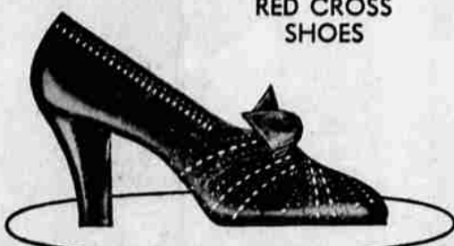
RED CROSS SHOES

White, gray and blue are the season's accepted smart colors. Fortunately we are in a favorable position to fit you properly in the color you require.