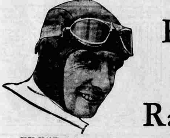
FRED FRAME —famous racing driver. Winner of Indianapolis Speedway Classic, 1932. Winner of Elgin Stock Car Race, 1933. Holder of twenty-one national and international world's straightaway records.

County to Sell Abandoned Land The Klamath county court is preparing to sell 52.94 acres of abandoned land to the state for reforestation purposes. In return, the county will receive an annual allowance of 5 cents an acre on the land. The land is scattered, and is valued at 25 cents an acre, members of the court said. County Grants Thirty Pensions More than 30 old age pensions have been granted by the Klamath county court. While no money was budgeted for pensions, it has been held the law must be followed and