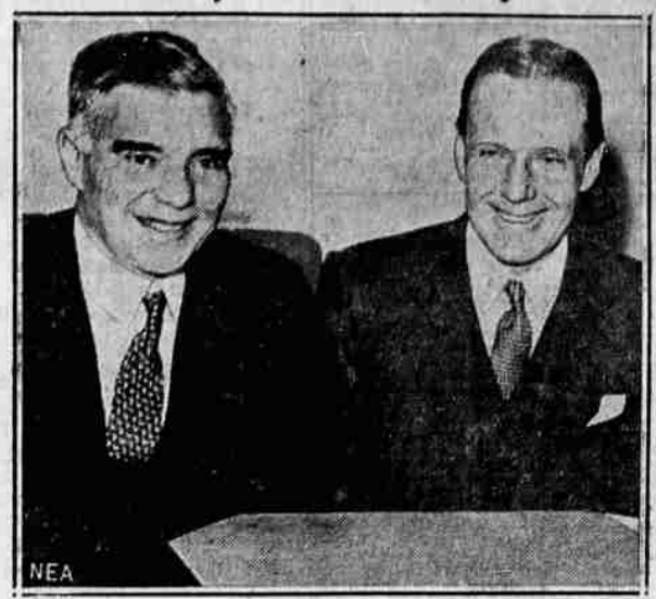
It's one of his first official calls as first Soviet Ambassador to the United States. And that's why Alexander A. Troyanovsky (left) was wreathed in smiles when this picture was taken as he called on Acting Secretary of State William Phillips in Washington.

of such importance that I prefer to ask the congress by specific enactment to vest in the United States government title to all supplies of American-owned monetary gold, with provision for the payment therefor in gold certificates.