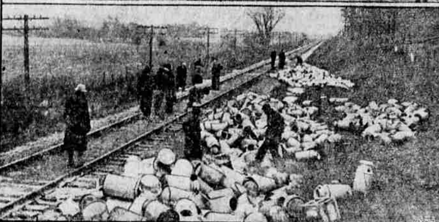
Milk strike pickets who defied a federal injunction to shut off Chicago's milk supply were foiled when one producer employed the big plane shown in the top photo to transport milk from Kankakee, Ill., to Chicago airport, where the ship is shown being unloaded under police guard. Plane transportation was resorted to after pickets halted, burned and upset inbound milk trucks and, near Burlington, Wis., crippled a Soo Line train from Wisconsin dairy farms and destroyed 200,000 gallons of milk by opening tank car faucets and dumping cans from box cars. The lower photo shows the emptied cans dumped along the right of way.