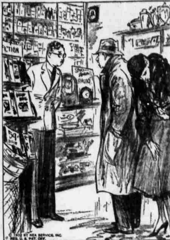
"What, no umbrellas? What kind of a drug store is this?"