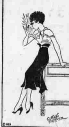
A ring on her finger puts a belle on her toes.