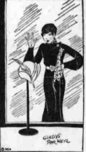
Now's the time to shop, look and looos.