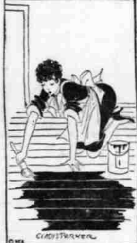
It isn't always fun for a woman to put on a new coat.

Watch for Me Every Day in THE KLAMATH NEWS The Evening Herald