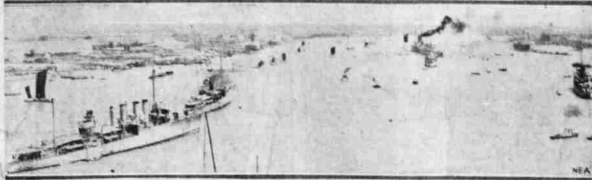
Here is the objective for warships of several nations, now speeding toward China, the warship anchorage in the Whang-Poo river at Shanghai, where naval detachments under various flags will alertly await developments in connection with the Japanese bombardment and occupation of Shanghai.