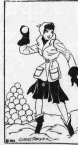
A person who throws snowballs doesn't always make a hit.