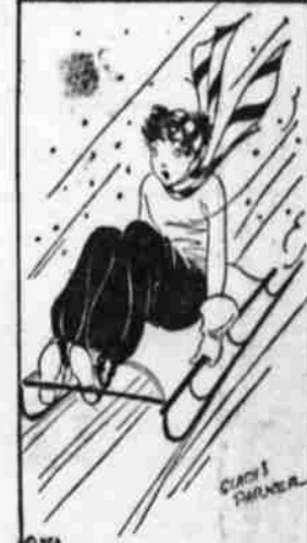
It's tough sledding for the person who's contented just to coast along.