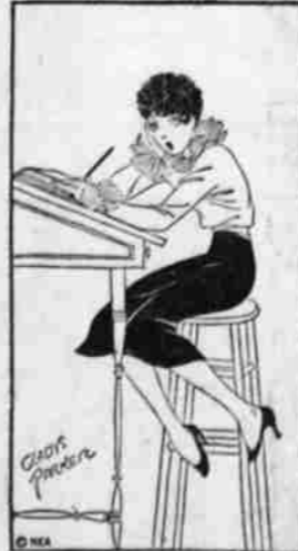
Even a book-keeper sometimes feels no account.