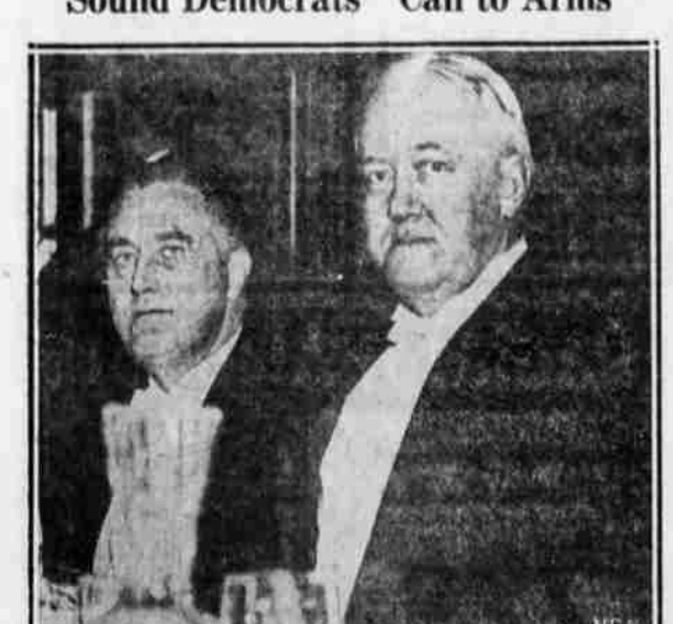
Two of the nation's foremost democrats here are pictured at New York's "Victory Dinner," one of 60 held simultaneously throughout the country. Governor Franklin D. Roosevelt, left, sounded his party's "call to arms." John W. Davis, right, democratic standard bearer in 1924, opened the drive for funds to wipe out the party's deficit.