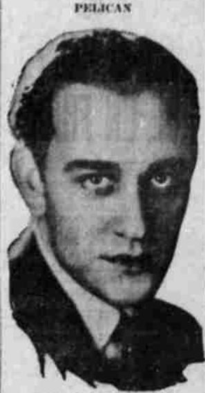
Conrad Nagel who plays opposite Betty Compton in the dramatic picture, "Three Who Loved," starting at the Pelican theatre tomorrow. Today will mark the final showing of William Boyd and Dorothy Sebastian in "The Big Gamble."

The Pelican: Starting Friday, "Three Who Loved," with Conrad Nagel and Betty Compton. The Pine Tree: Now playing, "The Smiling Lieutenant," with Maurice Chevalier. The Rainbow: Starting Friday, "Inspiration," with Greta Garbo. The Vox: Now playing, "A Dangerous Affair," with Jack Holt.