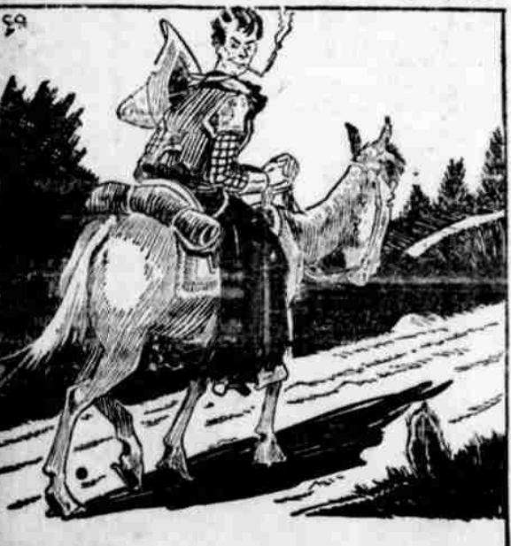
A COWBOY rode 32 miles on horseback. A certain number of miles was down hill. Twice as far, plus 8 miles, was level and the distance up hill was one-half as far as the distance on the level. How many miles did he travel on each stretch?