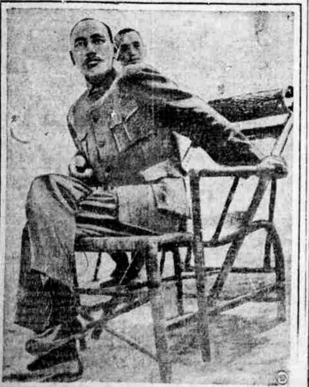
They do strange things in these Chinese wars—they postpone battle when it rains and commanding generals carry arm-chairs to the battlefield. In this unusual picture which has just reached the United States you see General Chiang Kai-shek, leader of the Nationalist troops, comfortably ensconced in a chair as he directs his troops against the Chinese Reds in the interior.