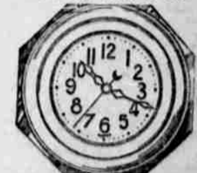
Kitchen Clocks At About Half Price $2.95 apiece

The Lamp sketched has a "pewter" base and a Vellum shade—an exact reproduction of an old oil lamp of Colonial days. Electric lighted, of course. Made to sell for two dollars. One to a buyer so that all may share at 95c.