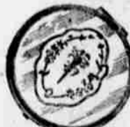
Compacts For Fair Ladies One Forty-Five

Enamelled Compacts in a number of charming styles and colors. (And all are as new as the morning!) Made to sell at three and three fifty—Early Buyers are to get them at $1.45.