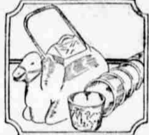
The Camel Holds More Than One Drink Ninety-Five Cents

In order to repay those who help us by shopping early we shall sell these new and artistic Pie Plates at half price. The lining is oven proof pottery in a lovely shade of green. The frame, nickel-plated metal. One to a buyer, please, at 95c.