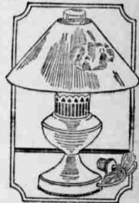
Colonial Lamp For Early Buyers Ninety-Five Cents

In the style sketched. Imported Ash Trays of Swedish steel in antique style. They were intended to sell at a dollar, but we own them so they can be sold at twenty-five cents apiece.