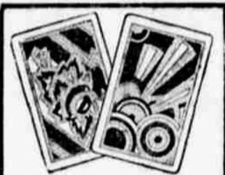
Playing Cards 4 Decks 95c

"Ye Fearful Saints Fresh Courage Take—the Clouds Ye So Much Dread—Are Big With Blessings That Shall Break—In Showers on Your Heads!" —Isaac Watts