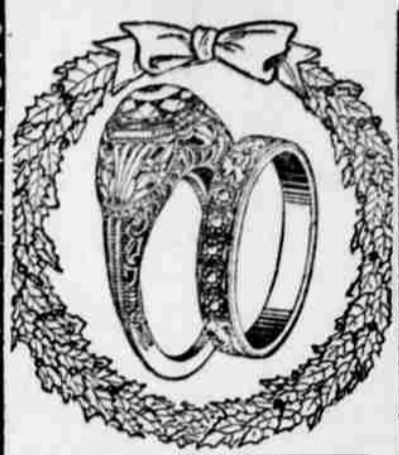
The Honeymoon Combination $29.50

Enamelled Compacts in a number of charming styles and colors. (And all are as new as the morning!) Made to sell at three and three fifty—Early Buyers are to get them at $1.45.