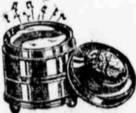
Musical Powder Boxes for Three Ninety-Five

As sketched. Pottery camel in colors and six drinking cups to match. For tea (or what have you!) Made to sell at two dollars—complete for ninety-five cents. One to a buyer, please.