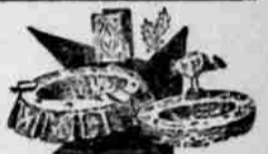
Ash Trays Less Than Half 25c apiece

In styles that duplicate the Sterling Silver affairs that cost as much as a new tire for a Ford! Silver plated of course—while we have any, the Early Bird gets them for, the pair 75c.