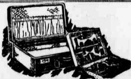
Fitted Cases for Fair Women $24.50

As suggested in the sketch—Genuine Leather covered Suit Case with an inner case which holds all the toilet needs a woman simply has to have when away from home.