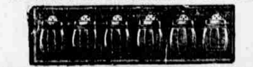
Sterling Silver Salts and Peppers Six in Box for 75c Set

Two hundred pieces of this fashionable glassware to be sold at half price to induce and reward Early Buyers. The collection includes: Cake Plates—Mayonnaise Bowls—Candy Jars—Powder Jars—Compotes—Bon-Bon Dishes—Relish Dishes—and so on. Each piece is anti-black ornamented with Sterling silver deposit and wondrously beautiful. . . . Limit of three pieces to each buyer at Ninety-five Cents each.