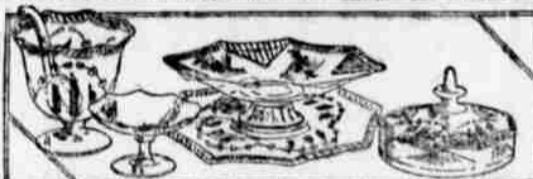
Stunning—Black Glassware Edged with Silver for 95c

Two hundred pieces of this fashionable glassware to be sold at half price to induce and reward Early Buyers. The collection includes: Cake Plates—Mayonnaise Bowls—Candy Jars—Powder Jars—Compotes—Bon-Bon Dishes—Relish Dishes—and so on. Each piece is anti-black ornamented with Sterling silver deposit and wondrously beautiful. . . . Limit of three pieces to each buyer at Ninety-five Cents each.