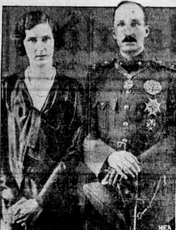
Now on Bulgarian soil, where they were reported the objects of an attack by assassins, are King Boris of Bulgaria and his recent bride, the former Princess Giovanna of Italy, pictured above. This is the first picture to reach this country showing the royal couple posed together. At Sophia, the capital city, the new queen will be the central figure in elaborate coronation ceremonies.