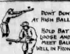
DONT BUNT AT HIGH BALLS HOLD BAT LOOSE AND MEET BALL WELL IN FRONT