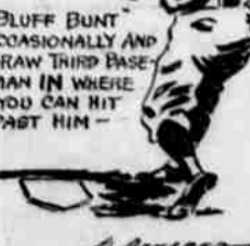
"BLUFF BUNT OCCASIONALLY AND DRAW THIRD BASE MAN IN WHERE YOU CAN HIT PAST HIM"