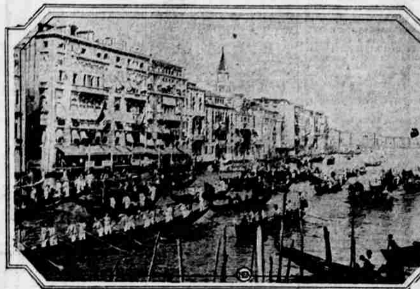
These aren't street sweepers, but they are sweeping the streets of Venice—with their oars. Here's the scene that was enacted recently in this odd Italian city when the annual gondola races were held on the Grand Canal. Urged to put on more speed, the oarsmen probably replied: "We are going as fast as we can!"