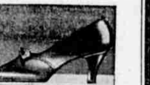
The Dainty... in black satin kid, also Lido brown kid and patent.

• by mere man • for modern women Yes, it was a mere man who designed this graceful pump for you. And what a wisp of a shoe it is. Smart? Indeed! And light as a whisper. For it is made by an entirely new process—without a tack or stitch or seam in the sole. A Red Cross Shoe, you'll be glad to know, fashioned over the famous "Limit" lasts—perfectly fitting, and giving your foot the support it needs, where it needs it. Just one of the many new models we are waiting to show you.