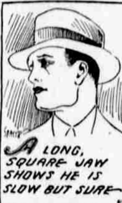
A LONG, SQUARE JAW SHOWS HE IS SLOW BUT SURE