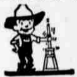
"We churn the things you yearn."