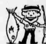
Buy Your License at The Gun Store