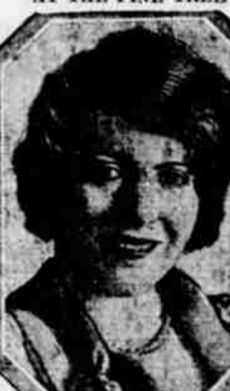
RUTH CHATTERTON in the Paramount Picture "The Laughing Lady"

Clive Brook, who was Ruth Chatterton's leading man in "Charming Sinners" is to be seen and heard in support of the Paramount star for the second time in "The Laughing Lady," at the Pine Tree now.