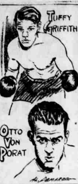
OTTO VON PORAT