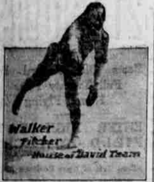
A WHIZ outfit of horsehide chasers, but as comical and interesting a crew as ever swung the willows in anybody's back yard.

The fast and funny, original and only House of David nine from Benton Harbor, Mich., will anchor at the local port this week-end for a double-header on Sunday with the Pelicans.