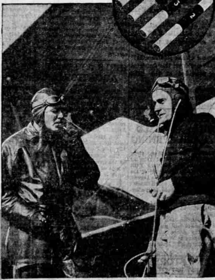
On your Radio . . . OLD GOLD—PAUL WHITEMAN HOUR . . . Paul Whiteman, King of Jazz, with his complete orchestra, broadcasts the OLD GOLD hour . . . every Tuesday, from 9 to 12 P. M., Eastern Daylight Saving Time, over entire network of Columbia Broadcasting System.