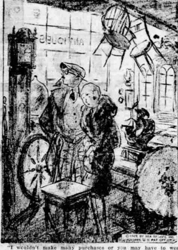
"I wouldn't make many purchases or you may have to wear a period hat this Easter."