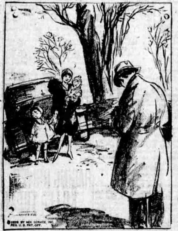
"Move over to the right—you're hiding too much of the car"