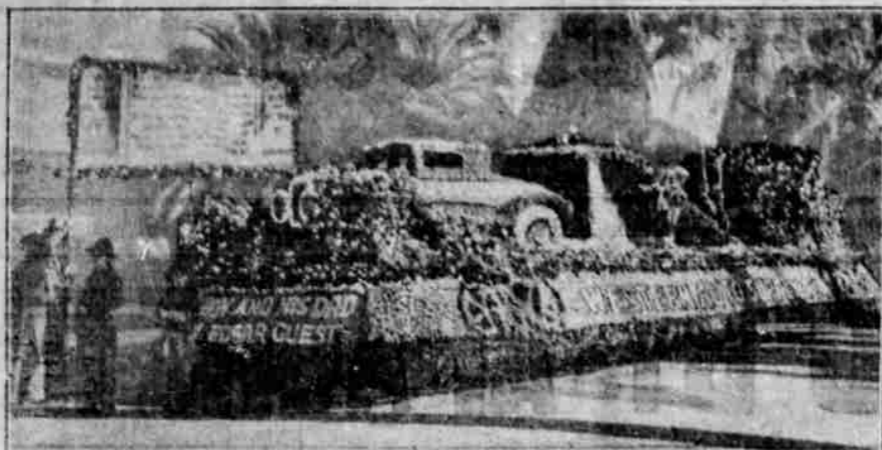
"A Boy and His Dad," Edgar Gussel's poem, was the theme of the Western Auto Supply Company's boat in the annual Tournament of Roses at Pasadena, California. The above entry, which won for the supply company the theme prize of the tournament, was decorated to give an impression of meadow and woodland with a miniature waterfall and lake. More than 150,000 natural blossoms were used in building the float.