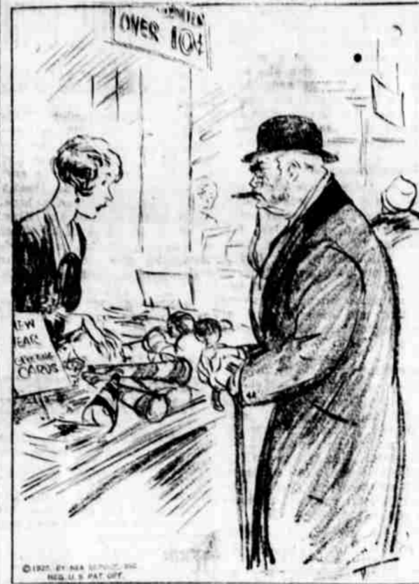
"Give me some toy balloons and one of those horns that go B-L-A-A-H!"