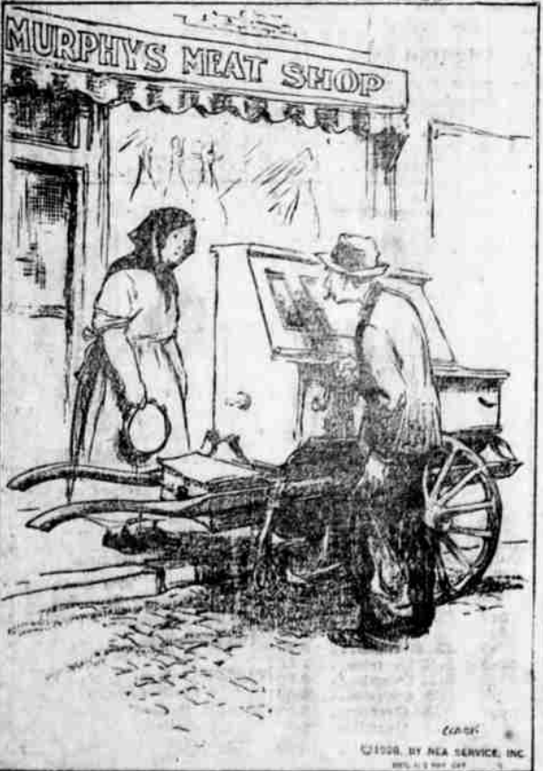
"Are you sure that's 'The Wearing of the Green'?"